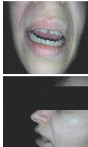
Fig. 2 – Predictors of a difficult airway with our patient: reduced mouth opening.

Preoperatively, two large-bore peripheral intravenous (IV) cannulas (16 G) were placed and the patient received ranitidine 50 mg i.v., ondansetron 4 mg i.v., and dexa-