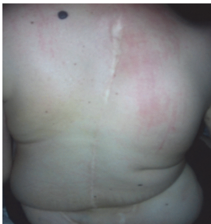
Fig 3. – Post-corrective surgery for thoracolumbar kyphoscoliosis of our patient.